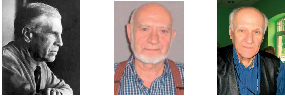
Figure 3: The mathematicians at Steklov: Lev Semyonovich Pontryagin, Vladimir Grigor'evich Boltyanskii, and Revaz Valerianovich Gamkrelidze

One criticism made of Isaacs' work was that it was not mathematically rigorous. He worked in the spirit of such great applied mathematicians as Laplace, producing dramatically new ideas which are fundamentally correct without rigorous mathematical proofs.